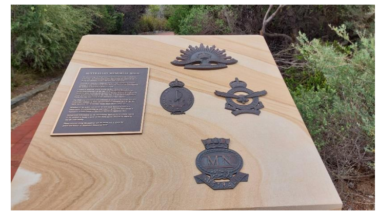
The 'desk' of the new plinth