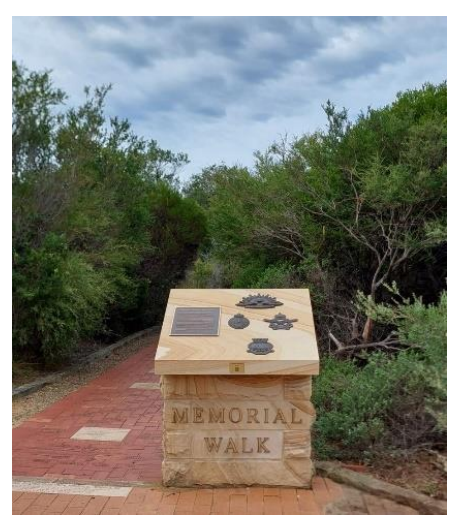
The rebuilt plinth

Please proceed along the pathway and we invite you to enjoy the peace and beauty of Australia's Memorial Walk.